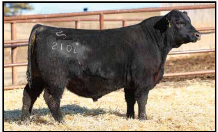
PINE COULEE COUNTDOWN 210L Sells as Lot 90