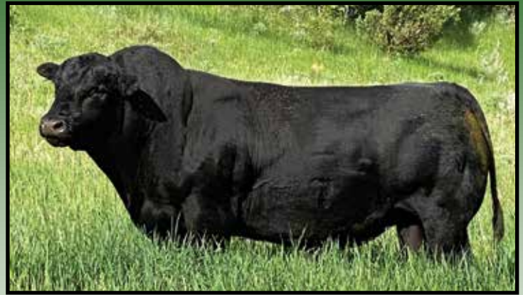
PINE COULEE UNFORGIVEN E307 Sire of Lots 191, 192, 193, , 73, 74 and 75