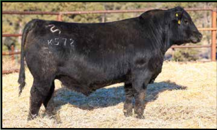
PINE COULEE SAGA K572 Sells as Lot 26