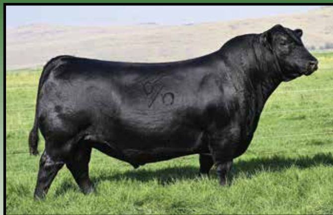
COLEMAN GLACIER 041 Sire of Lots 99, 100, 101, 102, 103 and 104