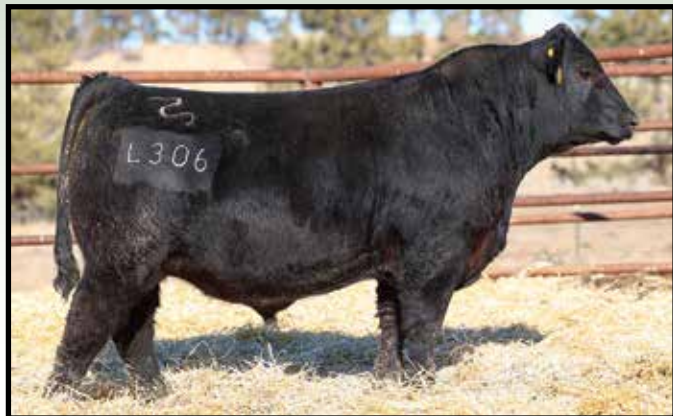
PINE COULEE GLACIER L306 Sells as Lot 103