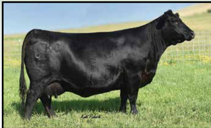
MW BLACK NELLIE RITA 032 Dam of Lots 103, 104, 130, 157 and 158