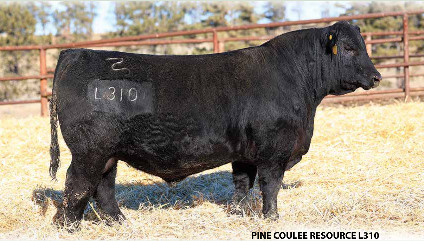
PINE COULEE RESOURCE L310 Sells as Lot 60