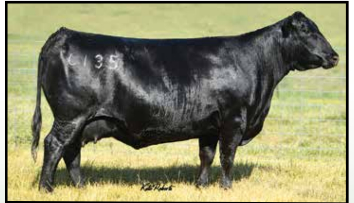
PINE COULEE BLACKBIRD C135