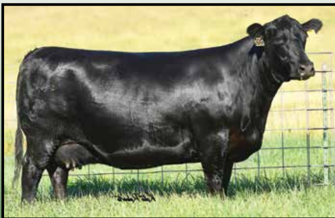
PINE COULEE EVER ENTENSE D22