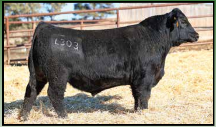
PINE COULEE RENOVATION L303 Sells as Lot 58