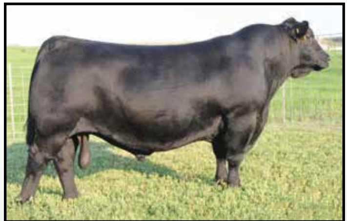
S A V RENOWN 3439 Sire of Lot 66, 67, 69 and 159