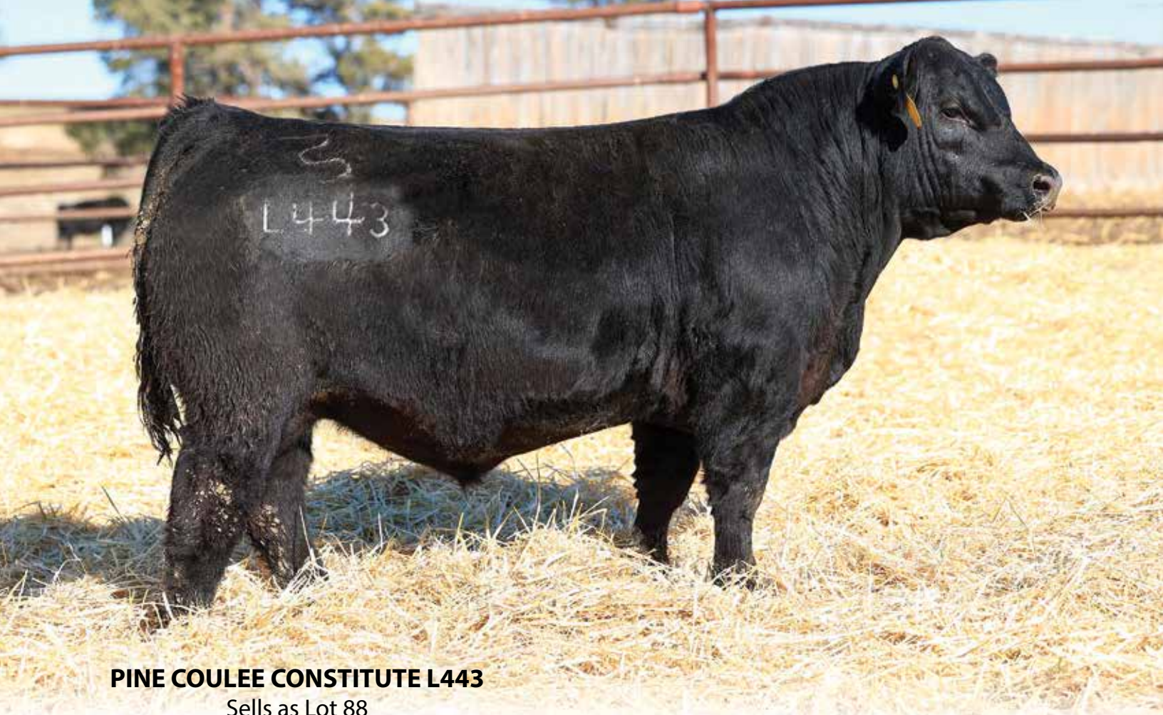
PINE COULEE CONSTITUTE L443 Sells as Lot 88