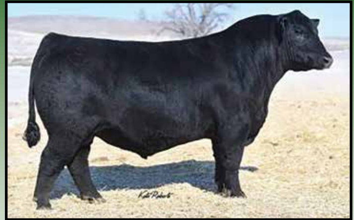
SITZ RESILIENT 10280 Sire of Lot 108