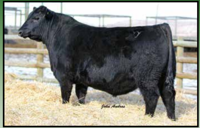
EAR GOLD RUSH H83

Sire of Lots 51, 52, 53, 54, 55, 57, 134, 135, 136, 137 and 139