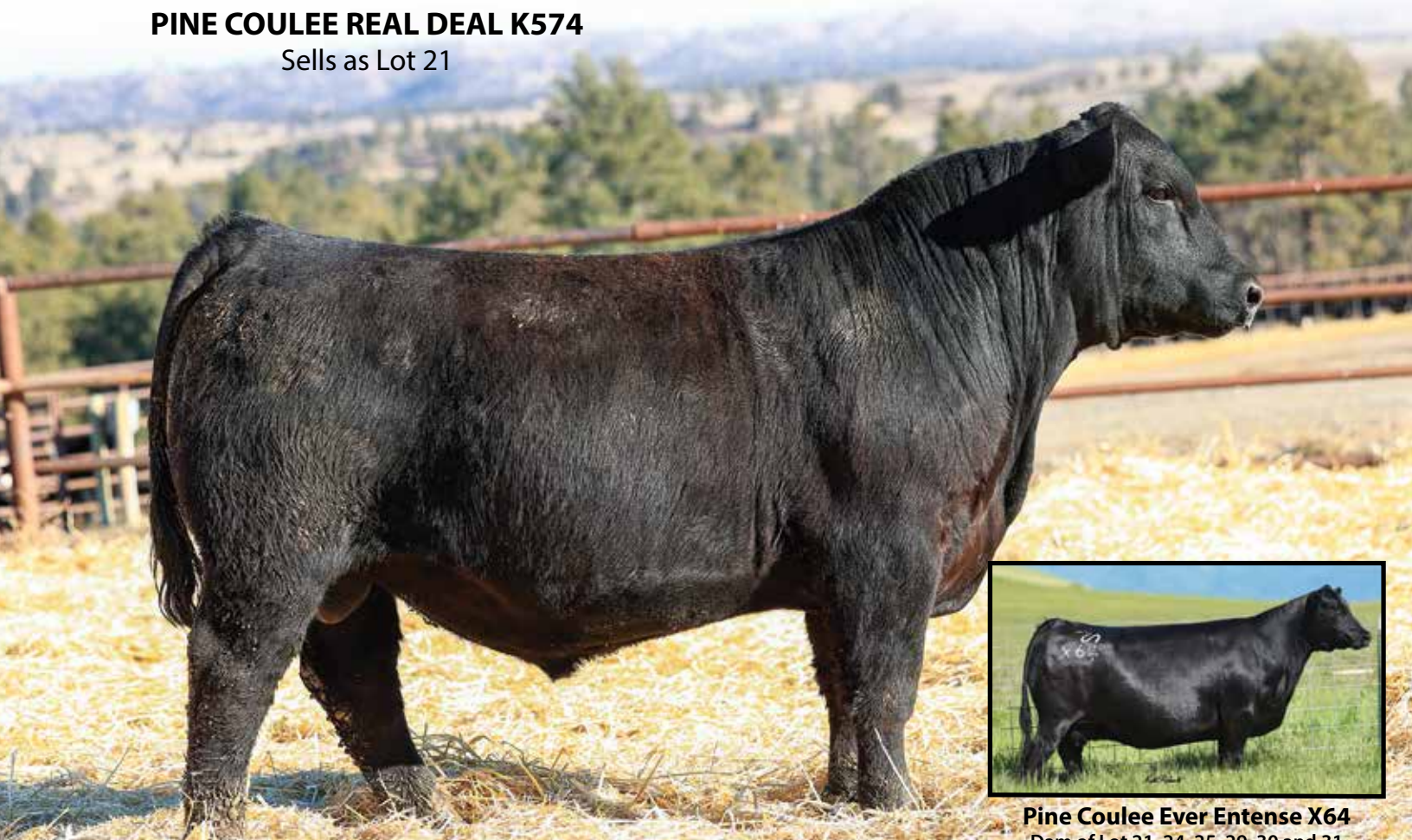
Pine Coulee Ever Entense X64 Dam of Lot 21, 24, 25, 29, 30 and 31