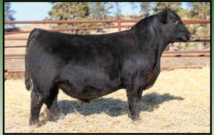
PINE COULEE GLACIER L315 Sells as Lot 101