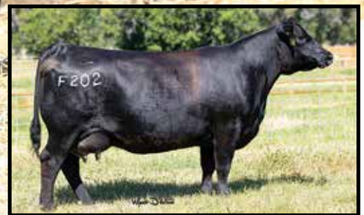
PINE COULEE DIXIE ERICA F202 Dam of Lot 124 and 125