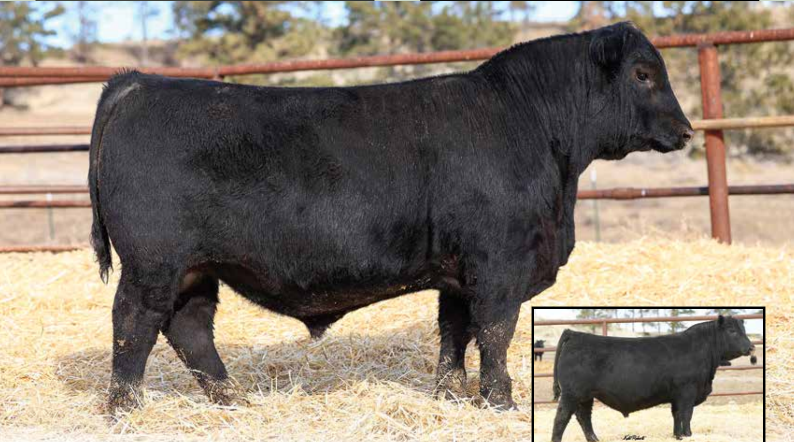
PINE COULEE NORTHERN 180L Sells as Lot 116