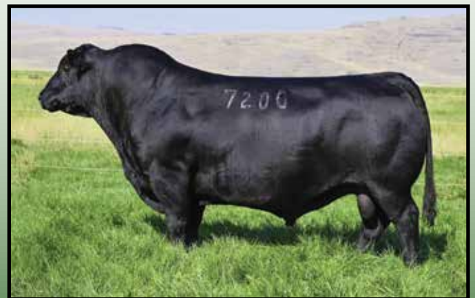
COLEMAN ROCK 7200 Sire to Lots 49 and 50