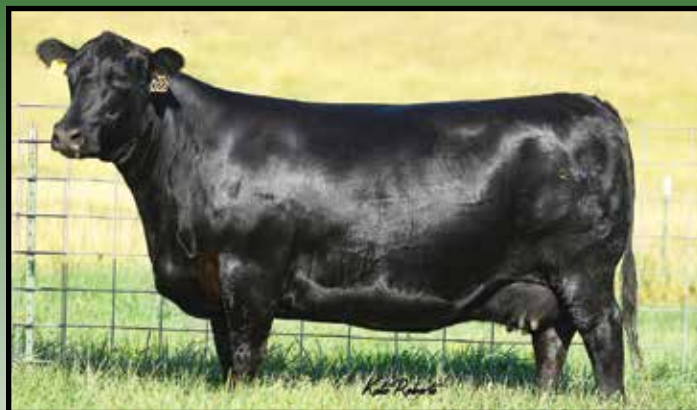
PINE COULEE EVER ENTENSE D22 Dam of Lots 33, 46, 47 and 150