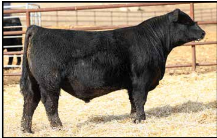
PINE COULEE N LIGHTS 151L Sire of Lot 110