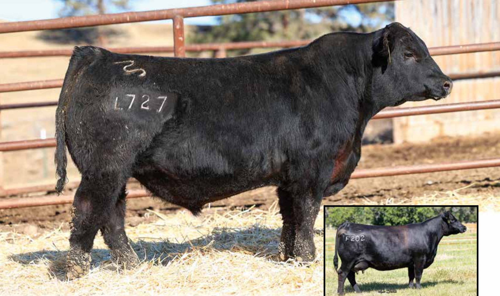
PINE COULEE INTENSITY L727 Sells as Lot 124