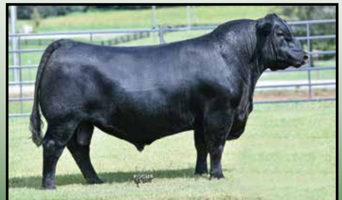
INGRAMS INTENSITY 0030 Sire of Lots 124, 125 and 128