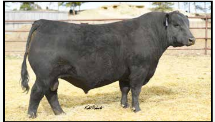
PINE COULEE DRIFTER G372 Sire of Lots 35, 36, 37 and 38