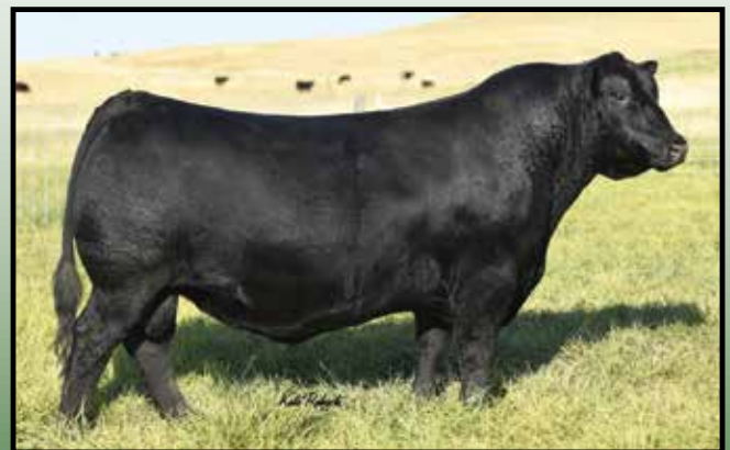
SHIPWHEEL NORTHERN LIGHTS Sire of Lots 110, 111, 112, 114, 153, 154, 155 and 156