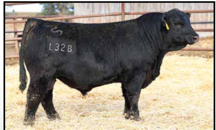
PINE COULEE EXECUTIVE LAW L328