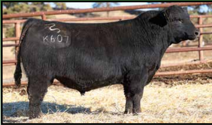
PINE COULEE COUNTDOWN K607 Sells as Lot 41