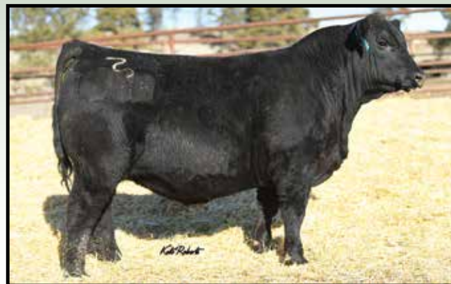
PINE COULEE FOUNDATION H308 Sire of Lots 179, 180 and 33