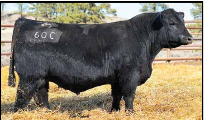
PINE COULEE RESOURCE 60C Sire of Lots 160, 161 and 71