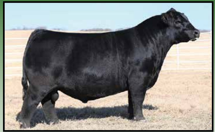
HUMMEL ARGENTINE Sire of Lots 147, 148 and 149