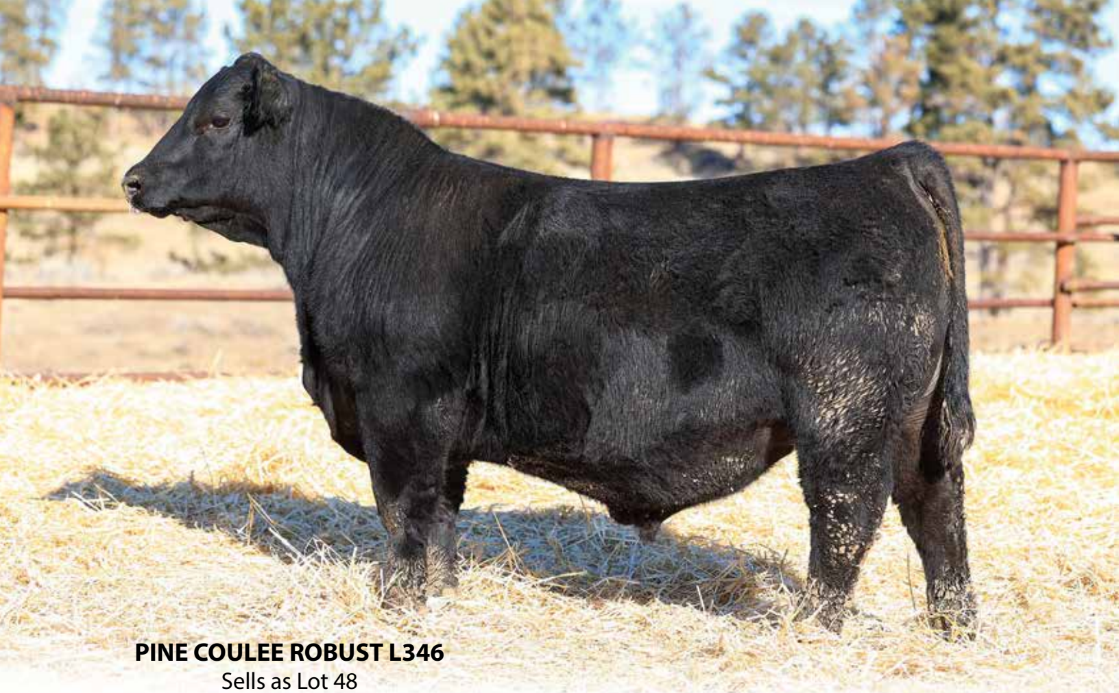
PINE COULEE ROBUST L346 Sells as Lot 48