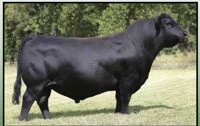
BC ROBUST 0807