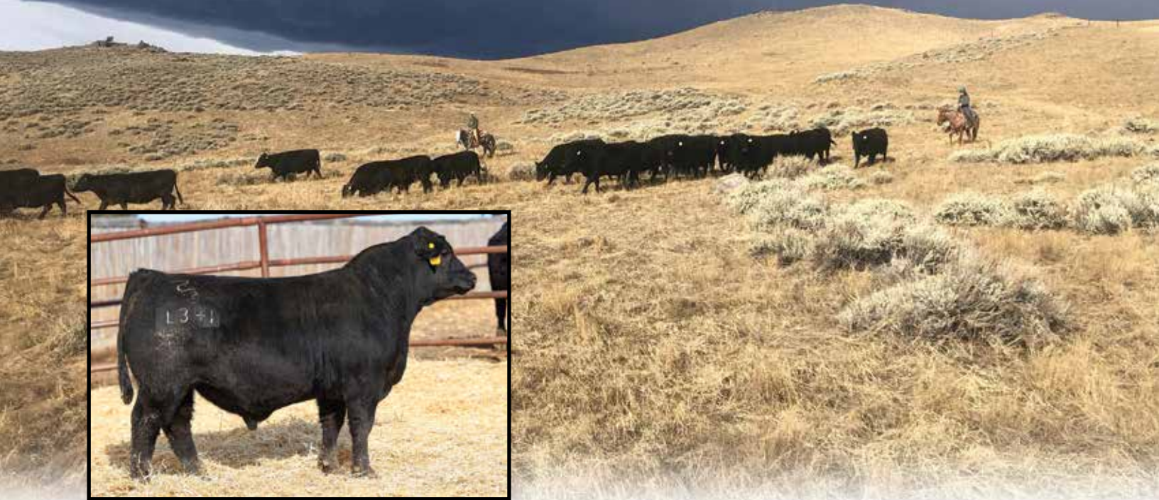
PINE COULEE ROBUST L341