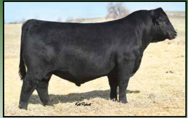
W SUNRISE EXECUTIVE LAW 507H

Sire of Lots 83, 84, 85, 86, 87, 42, 43, 162, 163, 165 and 166