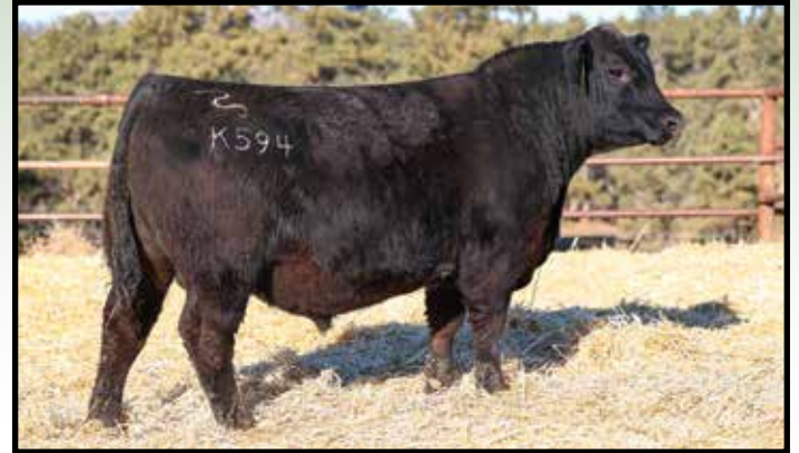
PINE COULEE DRIFTER K594 Sells as Lot 37