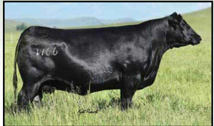
PINE COULEE ENTENSE W66 Dam of Lot 109