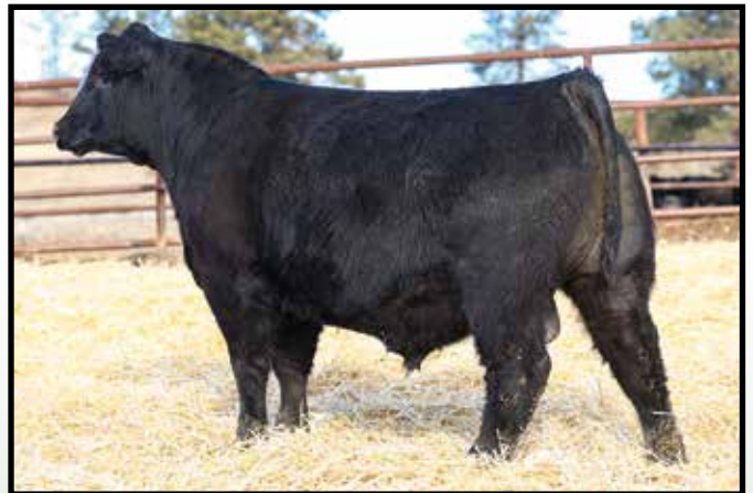
PINE COULEE GOLD RUSH 159L